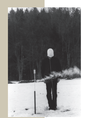
1983 Cap with Rocket

Signer does however appreciate the absurdism of the Dadaists. Which he clearly demonstrates in Cap with Rocket (1983), in which a rocket pulls a cap off of the artist's head. Although his actions are not functional, his oeuvre evinces a great interest in the reality that lies outside of the art world. His actions, without function but also not entirely without danger, can also be read as symbols or metaphors of an existential questioning.