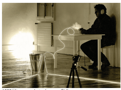
1987 Documenta 8, Aktion – Filmstill TV